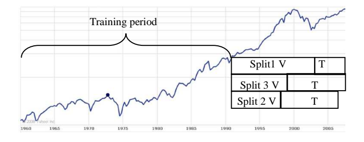
Figure 2. The S&P500 index over the periods examined. The training period is 1960—1991, and three data Splits are shown. "V" indicates either a test set used for evaluation regime 1, in which case the rule tested is the one that performed best over the training period. "T" indicates the test set for evaluation regime 2, in which case the rule tested is the one which, during training, performed best on the "V" period.

We experimented also with the evaluation periods within the Performance Consistency (PC) term of the fitness function. In Becker and Seshadri's work, the employment of the PC term clearly results in improved performance (this is also true in our replication; we omit the comparative results for reasons of space). However they only report on the use of 12-month periods. We experiment with four different lengths for the "PC period", namely 6, 12, 24 and 30 months. These are referred to later as PC6 PC12, PC224 and PC36.