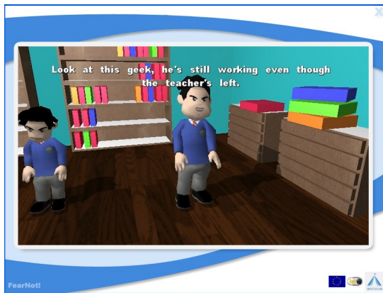
Figure 1. Bullying situation in FearNot!

The comics summarization system uses logs of stories generated by FearNot!. Fearnot! (Figure 1) is an interactive drama application that uses emergent narrative and a cast of autonomous characters to create improvised bullying situations which are unscripted by nature [2]. The user witnesses these virtual episodes emerge and helps the victim of bullying by suggesting coping strategies. The advice influences the character's behaviour in the next episodes without compromising its autonomy.