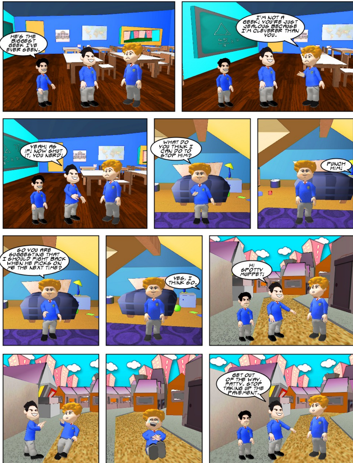
Figure 3. A segment from a comic strip created by our system depicting a story generated by FearNot!