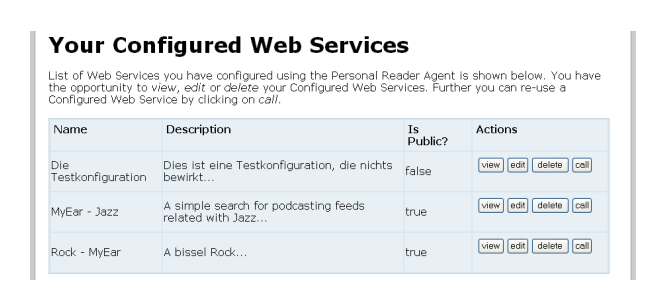
Figure 4: List of configured Web Services