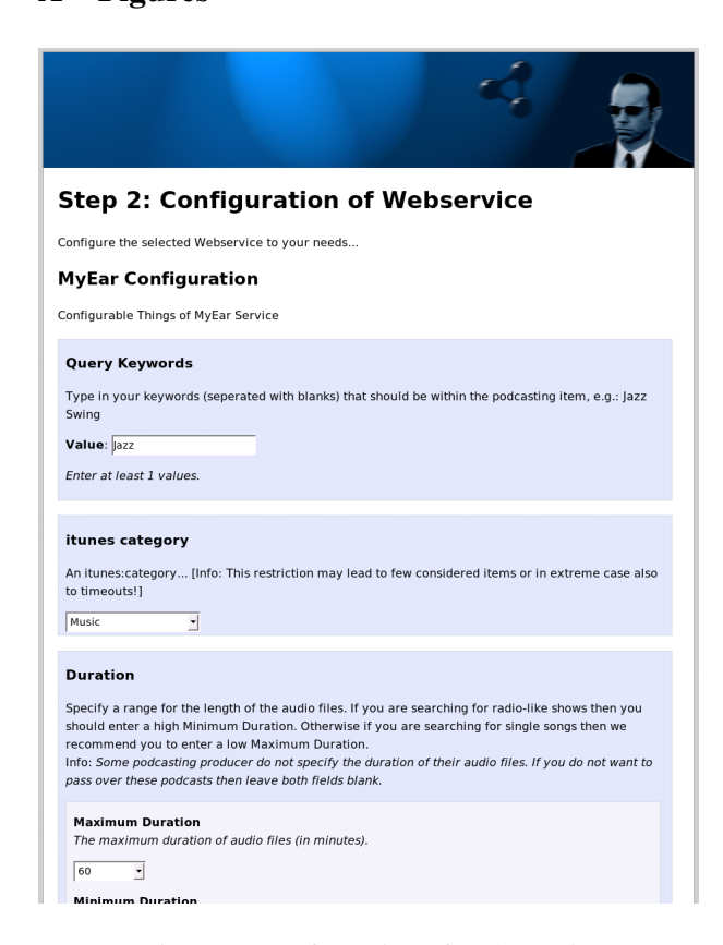
Figure 1: Configuration of Web Services