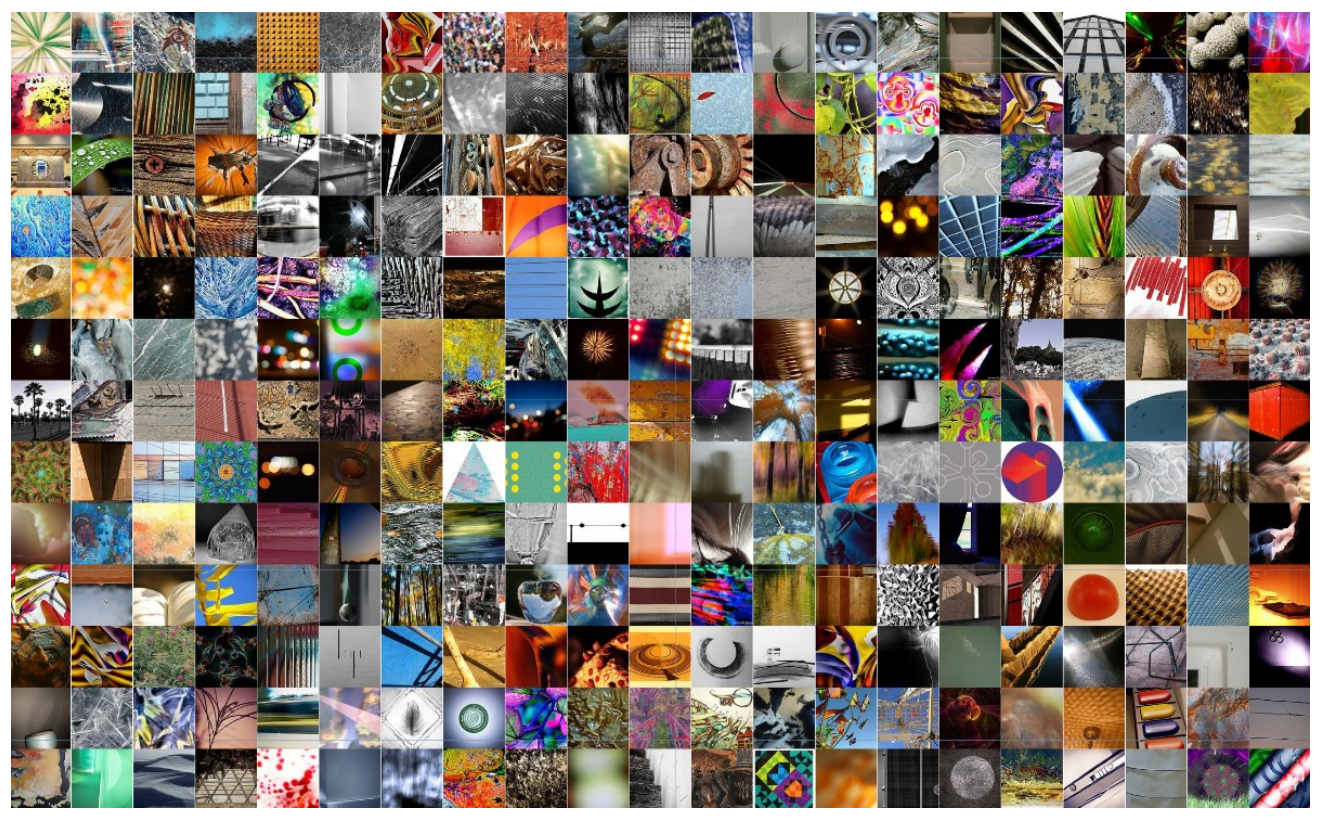
Figure 2. Set of images with words tagged as 'abstract' from Flickr and Google Images.