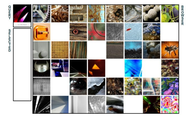
Figure 1. Example of the MTurk interface used to add new similarity judgements.

To create the similarity matrix to bootstrap the process, we asked 20 naive observers to group 100 random images (from the set of 500) as they saw fit. For the second stage augmenting the similarity matrix with new objects, we used Amazon's Mechanical Turk (https://www.mturk.com) a crowd-sourcing tool as we do not have access to a large art website or community. In it, users where presented with a game like interface (Padilla et al [7]) where they were shown an image and asked to match it with an image they thought was similar (Figure 1). MTurk users were rewarded with micropayments were payment amounts exceeded the UK basic hourly salary. We collected 2000 observations from 100 MTurk users, which we used to augment the similarity matrix of the whole catalogue of abstract art objects.