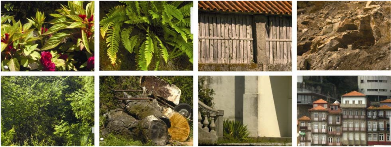
Figure 2. Eight of the 50 natural scenes used in this study (adapted from Fig. 2 of [2]). Examples of other natural scenes can be found in the references cited in [4].