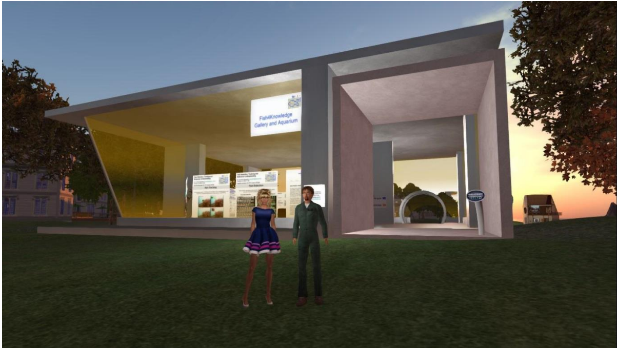
Figure 1: Front of the F4K Virtual World Gallery

The Fish4Knowledge virtual exhibition gallery is situated at a beauty spot by a lagoon at the heart of the Vue virtual world facilities. In this gallery, visitors are able to “walk” leisurely around our virtual building, via their avatars, to read about our project work and watch our underwater fish monitoring movies that were recorded at our observation sites. They are able to learn and be entertained in a beautiful surreal environment where the sunset is reflected by the nearby lagoon shining through the large floor-to-ceiling glass window walls. Alternatively, visitors can choose to visit our gallery on starry nights, or at any other times of the (virtual) day to enjoy the shimmering sea waves. Figure 1 shows the front of the F4K virtual gallery.