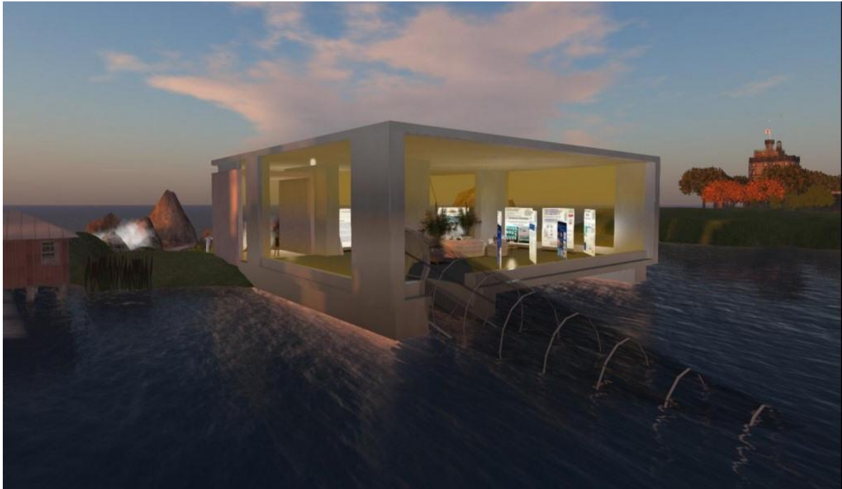
Figure 3: Tunnel to the Underwater Level