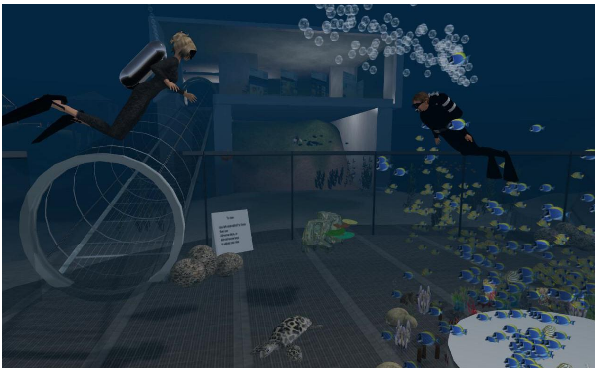
Figure 4: View within the Underwater Level